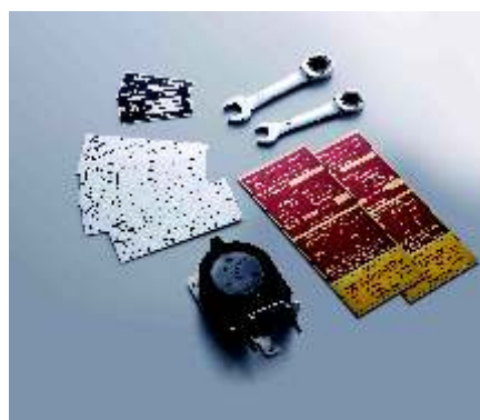
Flat Table with Silicone Mat